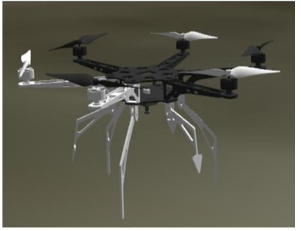
Fig.1 : Drone Detection from Images