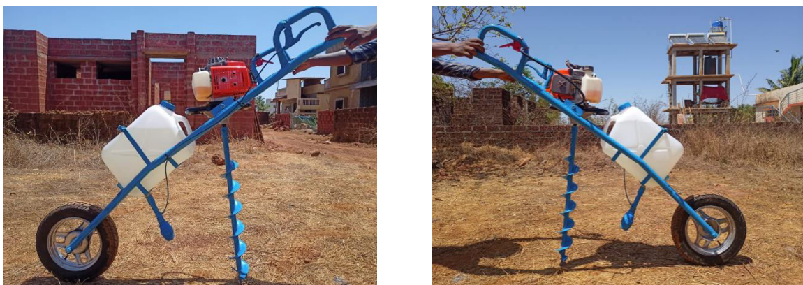
Fig.2 Growth Regulator Feeding Machine