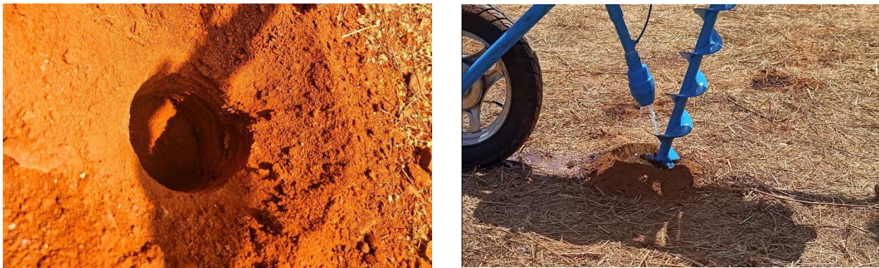
Fig.3. Dugged hole and Dispensing Mechanism

Overall, the results of our project demonstrate that the Growth Regulator Feeding Machine is a valuable tool for farmers and gardeners. This technology can help improve efficiency, productivity, and sustainability in agricultural operations, leading to better plant growth and higher crop yields.