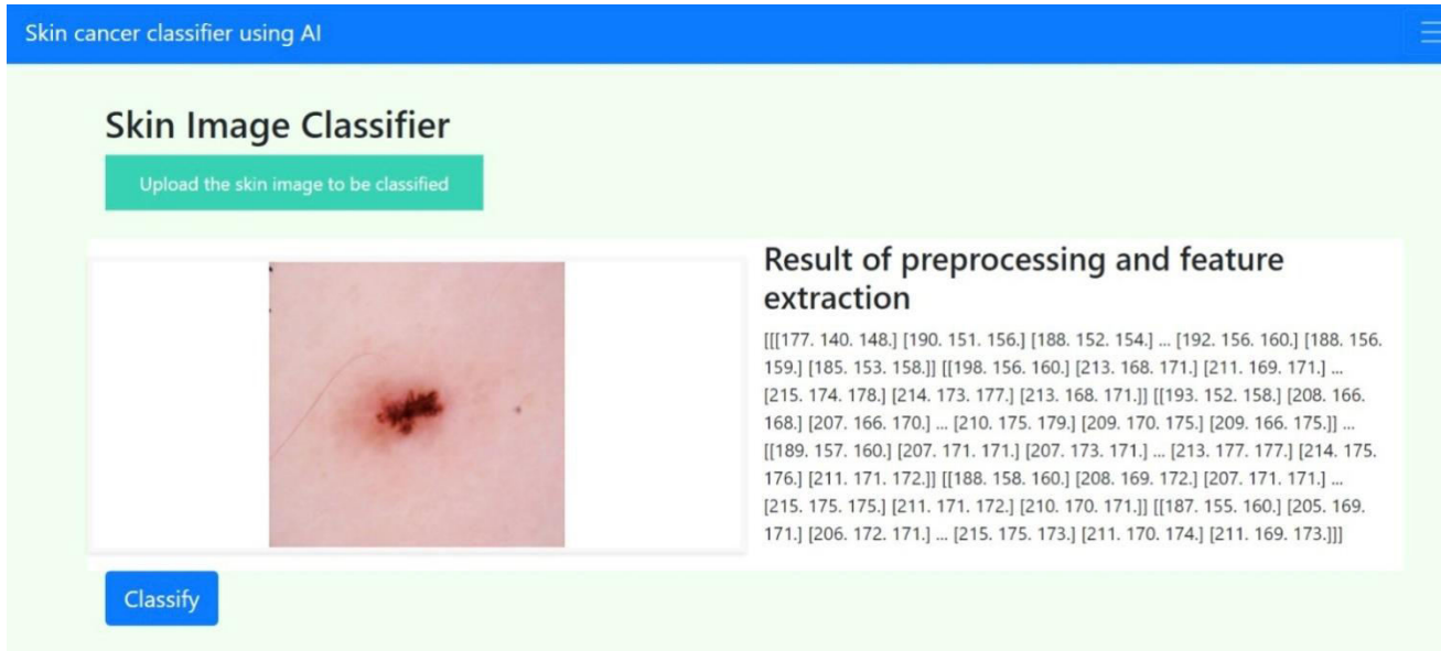
Fig (c)classification of image