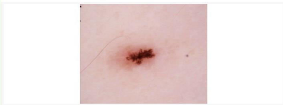
Fig (b) To upload the skin image to be classified