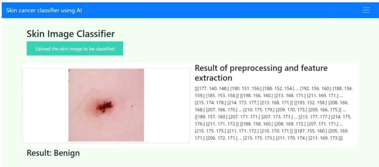
Fig (d)Result Obtained after classification