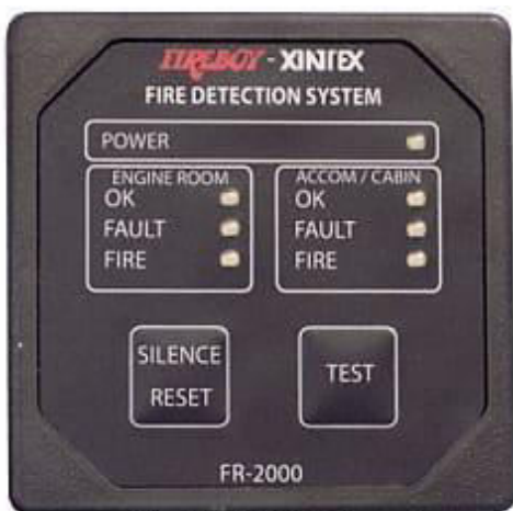
(Model FR-2000 shown)

The Application Working Diagram is as follows: