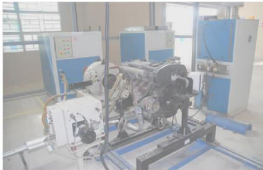
Figure 1: Mitsubishi 4D68 SOHC 2.0 L Diesel Engine Testing rig

The apparatus used for conducting the emission testing and analysis of the engine exhaust sample is located in Automotive Lab, Universiti Malaysia Pahang at Pekan. The first thing to start with was an engine and a dynamometer set up, the automotive engineering lab already consisted of a 150 KW eddy current dynamometer model ECB which was previously being used for engine testing as shown in Figure 1. The distributor pump in the Mitsubishi 4D68 engine was equipped with a centrifugally controlled timing device for correction of start of delivery. Moreover, the distributor pump was also equipped with a boost control device, a boost pressure actuated diaphragm mechanism that adjusts the maximum fuel delivery from the pumping element relative to the boost pressure. The delivery of fuel to the cylinders in a distributor pump always ends at the same stroke travelling independent of fuel quantity injected (Bosch 1996). The power unit was self contained in itself and came along with all the necessary components like vibration dampers, engine control unit and exhaust muffler mounted already. The specifications of the test engine are shown in Table 1.