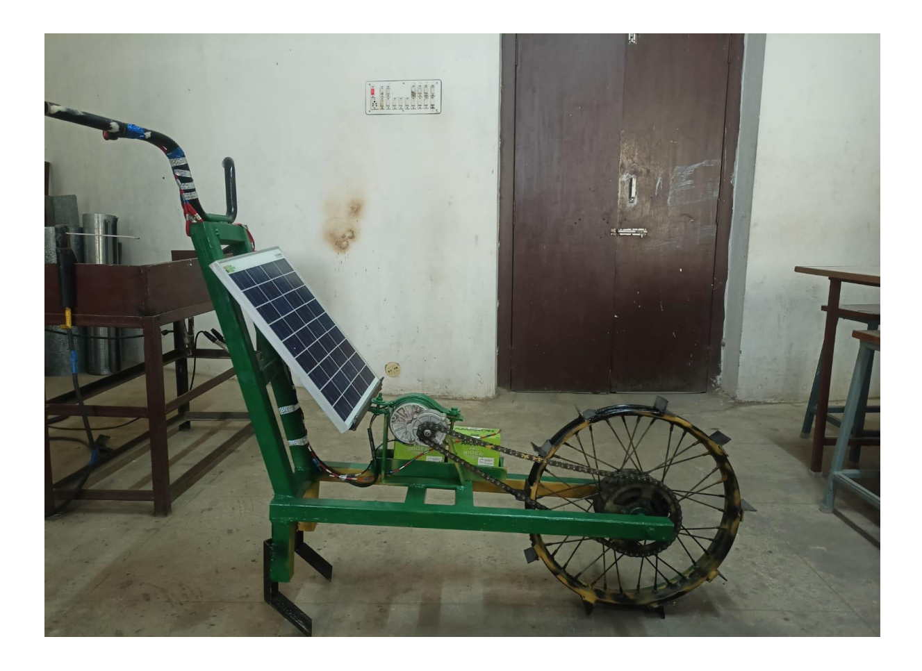
FIG:- SOLAR POWER TILLER