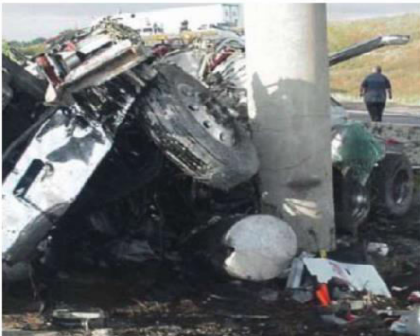
Figure 2: Collision

The addition of fibers is an alternative technique to enhance the impact resistance of bridge piers. Fiber-reinforced concrete (FRC) is a cement-based composite reinforced with discrete fibers that are usually randomly distributed. Fibers are added to the concrete mixture to bridge discrete cracks, thus increasing the control of the fracture process, also increasing the fracture energy, and providing more ductile behaviour. Fiber-reinforced concrete (FRC) has been