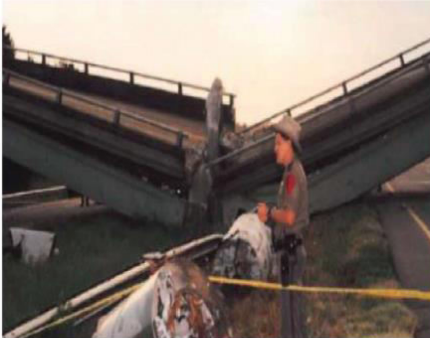
Figure 1: Bridge Collapse