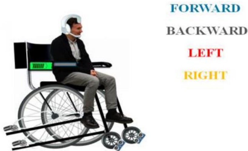
Fig: working voice recognition module

A microphone is used to capture input, sending vocal commands for stop, left, right, forward, and reverse. Electrical signals are typically used to communicate with the wheelchair when commands are issued [7, 8]. Speech recognition software is used to process signals before sending them to the Arduino. These instructions are transformed by Arduino into commands that the motors can understand. Through the motor driver, this directs and moves the wheelchair. Wheelchair-mounted DC motors are in charge of steering the chair's wheels. One motor controls the two wheels on the wheelchair's left side, and the second motor controls the two wheels on the wheelchair's right side [9].