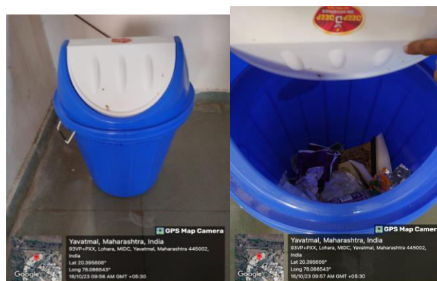
Fig 1: large dustbin, capacity 60lit

Firstly, we mark the location of the dustbin. Basically, we put 7 numbers of large dustbin on the ground floor which is of size 60 litters of capacity. These 7 numbers of dustbin are provided at each and every department of the college.