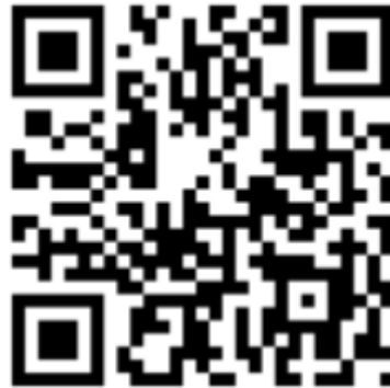
Fig.1: QR Code