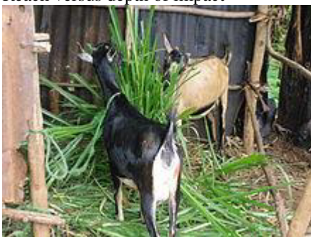
These goats are being raised by Rwandan women as part of a farm cooperative funded by microfinance.

There has been a long-standing debate over the sharpness of the trade-off between 'outreach' (the ability of a microfinance institution to reach poorer and more remote people) and its 'sustainability' (its ability to cover its operating costs—and possibly also its costs of serving new clients—from its operating revenues). Although it is generally agreed that microfinance practitioners should seek to balance these goals to some extent, there are a wide