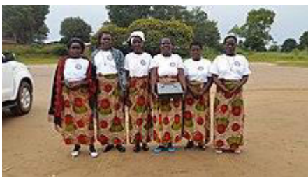
Women of Malawi posing with their savings box

If there were to be an exchange of labour, or if women's income were supplemental rather than essential to household maintenance, there might be some truth to claims of establishing long-term businesses; however when so constrained it is impossible for women to do more than pay off a current loan only to take on another in a cyclic pattern which is beneficial to the financier but hardly to the borrower. This gender essentializing crosses over from institutionalized lenders such as the Grameen Bank into interpersonal direct lending through charitable crowd-funding operations, such as Kiva. More recently, the popularity of non-profit global online lending has grown, suggesting that a redress of gender norms might be instituted through individual selection fomented by the processes of such programs, but the