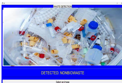
Fig. 1 Input Image

Figure shows the results of waste detection from an image by using deep learning algorithm.