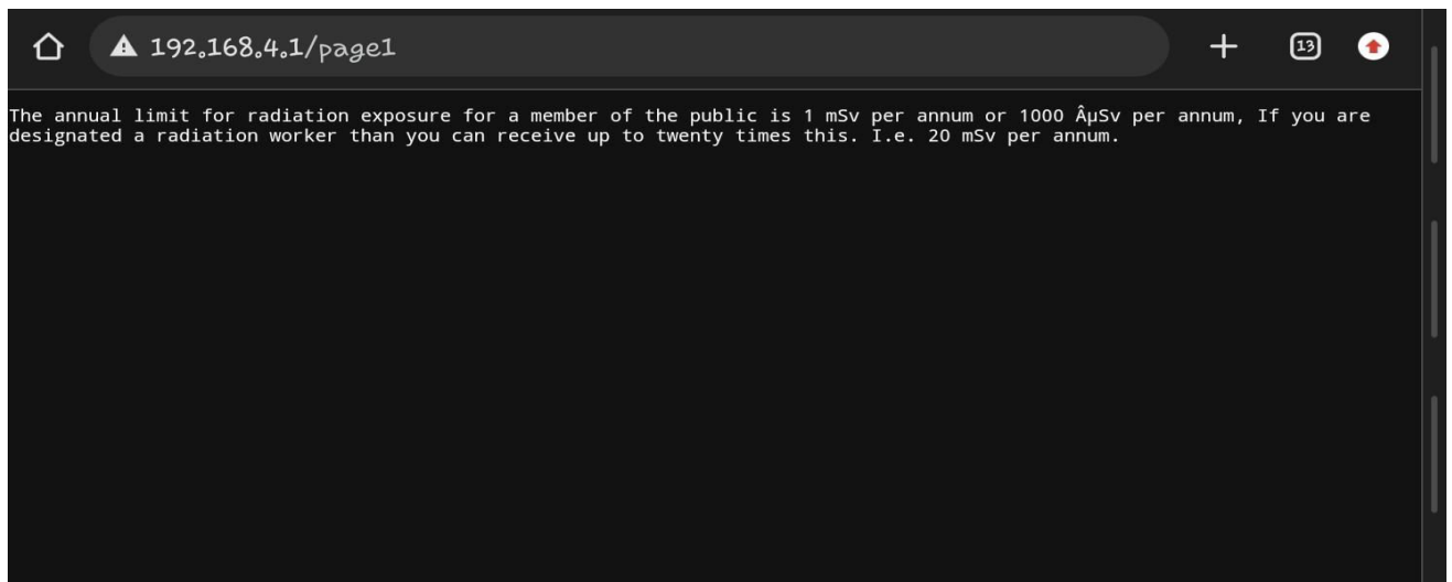
Figure 2 Results obtained at the webpage, the default webpage on STA mode is 192.168.4.1