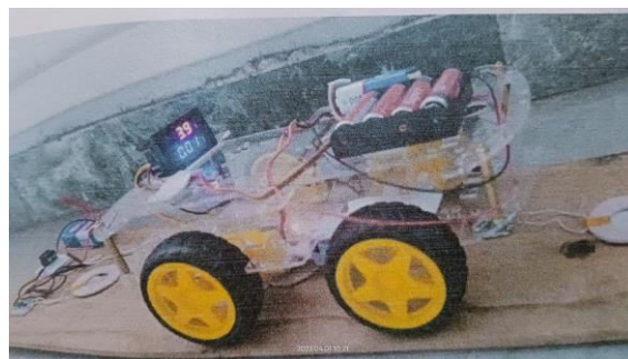
EV charging using Wireless Power Transmission

The real WPT prototype is presented and used to verify the established mathematical discretion of the used variable parameters as \beta and Transfer. This prototype composes of two coils, having a similar inductance value (set to 30 \mu H). This prototype is shown in Each transmitter module end-point is connected to the filter output in series through the AC bus line