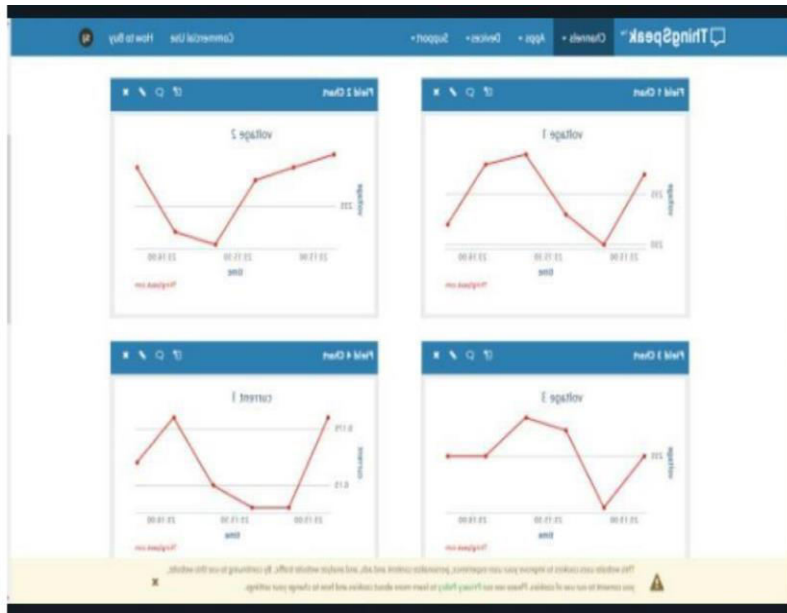
Table 1: Power status on each Phase of the loads

Dhaanish Ahmed Institute of Technology, KG chavadi, Coimbatore, India