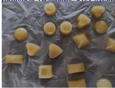
Figure 2 Passion fruit healthy gummies with different shapes

Dhaanish Ahmed Institute of Technology, KC Chavadi, Coimbatore, India