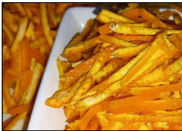
Fig 4. Orange Peel Thin strips

Washed and peeled the oranges as described above. Cut the peels into small pieces or thin strips. Arranged the peels in a single layer on a clean, flat surface and placed them in a tray dryer set to 50-60°C for 8-12 hours until they were hard and brittle. Checked on the peels every few hours and turned them over to ensure even drying[20].