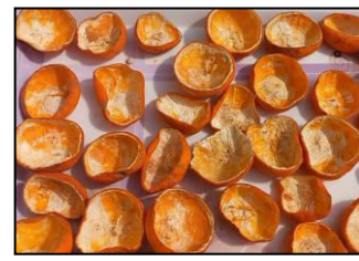
Fig 3. Sun Drying for 24 hrs