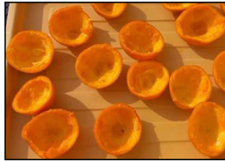
Fig 2. Peel Separation