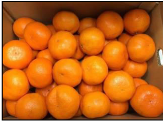
Fig.1 Orange Fruit

them to dry for 24 hours until they became hard and brittle. Turned the peels over every few hours to ensure even drying[19].