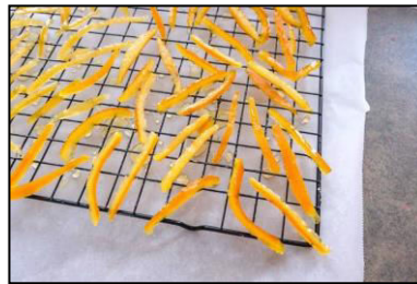
Fig 5. Tray Drying at 50°C