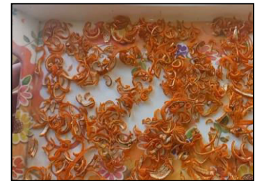
Fig 6 Dried Orange Peel

The incorporation of Orange peel powder enhanced the nutritional level of dietary fiber, Calcium and vitamin C in orange-flavored mayonnaise which may provide some health benefits, such as improved digestion and immune function. The microbial analysis was taken for mayonnaise stored in refrigerated condition and unrefrigerated condition to check the microorganisms such as Total plate count, Coliforms, Escherichia coli, Staphylococcus aureus and the result shows that all the microorganisms are under recommended level in refrigerated mayonnaise but the unrefrigerated mayonnaise has presence of microorganisms which exceeded the recommended level and unfit for consumption[21-24].