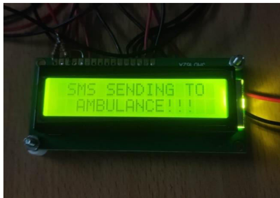
Figure 3: SMS sending to Ambulance

The above figure represents the over all hardware implementation of our project. “Auto-Alcho Safety Detector” .