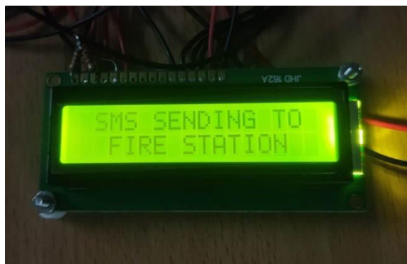
Figure 4: SMS Sending to Fire Station

The above figure represents the SMS sending to ambulance when the vehicle is met with the accident