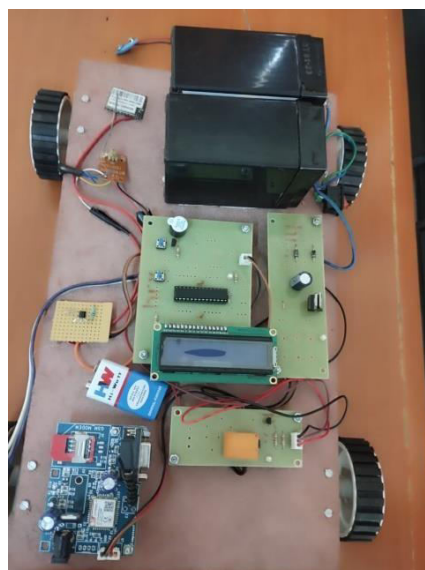
Fig 1: Hardware circuit

Experimental results In Proteus works by applying either a hex file or a debug file to the microcontroller part on the schematic. It is then co-simulated along with any analog and digital electronics connected to it. PIC Bundle is the complete solution for developing, testing and virtually prototyping your embedded system designs based around the Microchip Technologies TM series of Microcontroller. There will be a reference GPRS/GPS location. When the current location exceeds reference location, it intimates them through the Buzzer. The message will be transferred to the registered number in this stimulated module. LCD display will monitor or display the current location of the device. ARDUINO UNO is the processor used here for simulation to interface with GPS. The Hardware results Figure 1 and the final hardware output is displayed in the Figure 2.