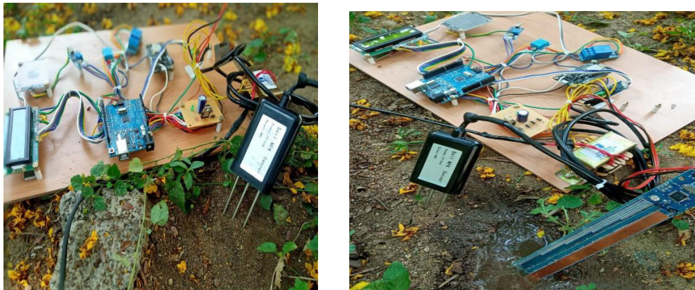
Figure3 Experimental setup