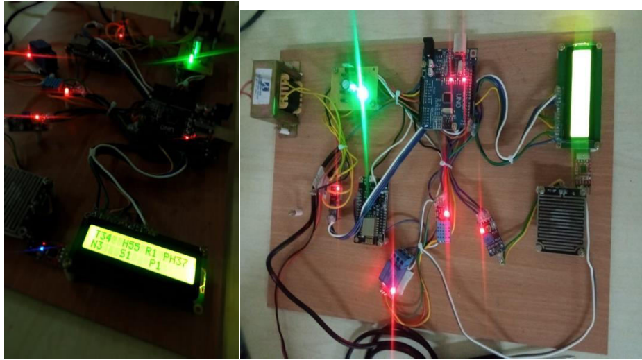
Figure2 Arduino and Sensors connected kit