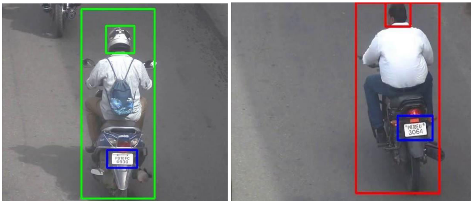
Figure a) Shows the Motorcyclist with helmet input from the pre recorded videos. Figure b) Shows the Motorcyclist without helmet input from the videos.