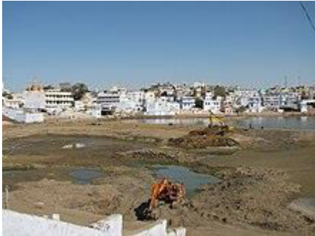
Pushkar Lake being dredged to fight silting

To supplement water supply to the lake, even as early as in 1993, the government built 12 deep tube wells to supplement water supply to the lake. However, most tube wells were dysfunctional, thereby aggravating the problem. The Union Ministry for Environment and Forests included Pushkar Lake on a list of five lakes under the National Lake Conservation Project (NLCP) for restoration. They have been providing funds since 2008 for the restoration works, but the situation has not eased. [41]