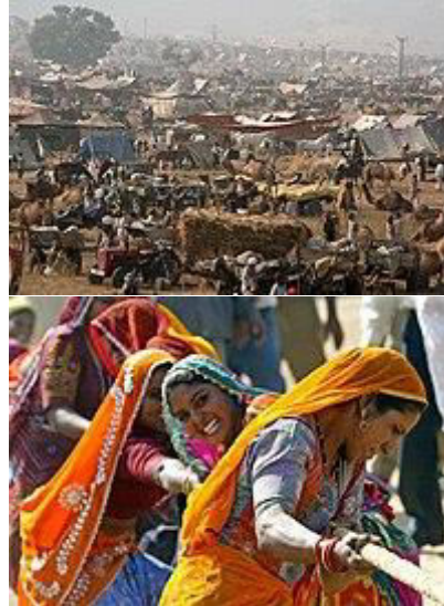
Pushkar Mela, 2006. Women enjoying the tug of war

The devotees are taking a holy dip at Pushkar lake on the occasion of Kartik Purnima on 24 November 2007