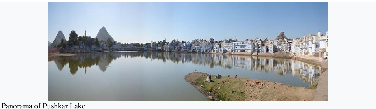
Panorama of Pushkar Lake

Sewage outfalls into the lake are proposed to be completely stopped by the interception and diversion of feeder lines. Lining the main feeders into the lake and setting up water treatment plants to continuously treat and recirculate the lake water are also envisioned. [39] Conservation measures proposed for adoption to clean the lake are by way of desilting, water treatment at inlet of feeders into the lake, construction of check dams, conservation of ghats, afforestation of denuded hills in the catchment, soil moisture conservation measures, stabilization of sand dunes by planting vegetation of suitable species of plants and restriction of cultivation in the bed of feeder channels. [39] In addition, the institutional measures considered for effecting improvement of the lake are mass awareness programmes with the population's participation as well as the control of fish proliferation to reduce the risk of death of fishes during periods of inadequate water depth in the lake. [39]