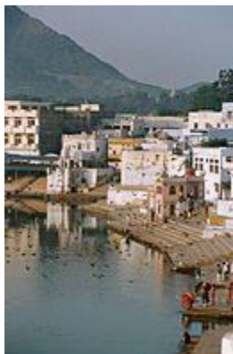
A view of the ghats at the Pushkar Lake