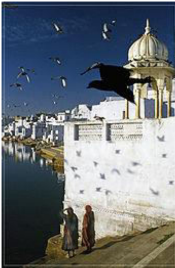
Early morning view of the ghats at the Pushkar Lake.

There are various legends from Hindu epics Ramayana and Mahabharata and the Puranic scriptures which mention the Pushkar Lake and the town of Pushkar surrounding it.