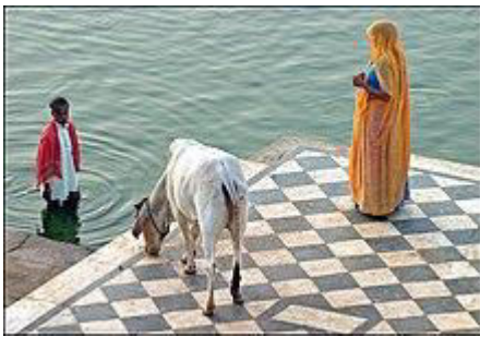
Morning view of one of the ghats on the lake

Ramayana and Mahabharata refer to Pushkar Lake as Adi Tirtha, or the "original sacred water-body". The famous Sanskrit poet and play-writer Kalidasa also referred to this lake in his poem Abhijñānaśākuntalam . [19] The Ramayana mentions that Vishwamitra performed penance at Pushkar Lake for a thousand years. In spite of Brahma appearing before him and granting him the higher status of a rishi instead of a royal-sage (rajarishi), Vishwamitra continued his penance, but, the celestial nymph apsara, Menaka came to the lake to take a bath. Vishwamitra was enamoured by her beauty and they decided to live together in pursuit of pleasure for ten years. Then, Vishwamitra realized that his main activity of penance was disturbed. He, therefore, took leave of Menaka and went away to the north to continue his meditation. [22] Vishwamitra was also described as building the Brahma temple at Pushkar after Brahma's yagna. [23] Mahabharata mentions that Pushkar is a holy place of the god Vishnu, considered as the Adi Tirtha where millions of tirthas united during sunrise and sunset, and visiting the lake and taking a holy bath in the lake would wash off all sins.