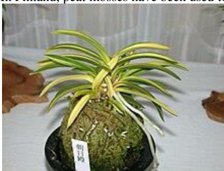
Long strand Sphagnum moss used in mounting a Vanda Falcata orchid

In Finland, peat mosses have been used to make bread during famines. [37]