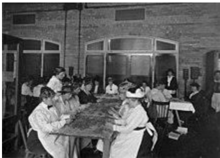
Sphagnum moss wound dressings being made at the University of Toronto c. 1914

Anaerobic acidic sphagnum bogs have low rates of decay, and hence preserve plant fragments and pollen to allow reconstruction of past environments. [8] They even preserve human bodies for millennia; examples of these preserved specimens are Tollund Man, Haraldskær Woman, Clonycavan Man and Lindow Man. Such bogs can also preserve human hair and clothing, one of the most noteworthy examples being Egtved Girl, Denmark. Because of the acidity of peat, however, bones are dissolved rather than preserved. These bogs have also been used to preserve food. [29] Up to 2000-year-old containers of butter or lard have been found. [30]