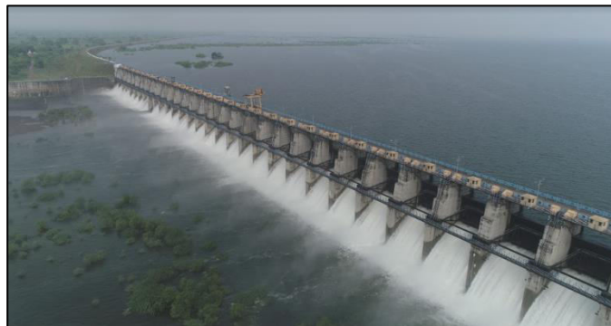
Fig 1 Actual Aerial Photograph of Lower Wardha-I