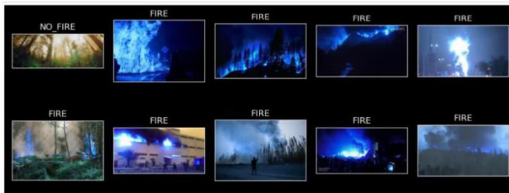
Fig: 3. Identifying Fire and Non-Fire Images

On the validation set, the proposed system was 92.5% accurate. This means that 92.5 percent of the photos were accurately categorised as fire or non-fire by the algorithm. The F1 score of the system was calculated to be 0.91. This demonstrates a balanced performance in terms of precision and recall. The recall of the system for fire images was 0.89, indicating that it correctly identified 89% of the fire images. The precision for fire images was 0.95, suggesting that 95% of the images classified as fire were indeed fire images.