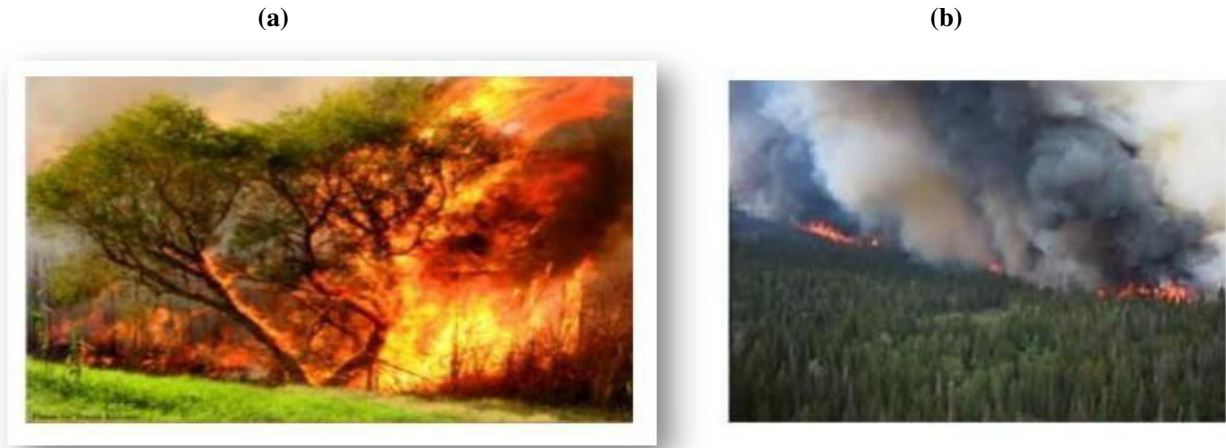
Fig:1.(a) Indicating Flames (b) Indicating Smokes

Moreover, the system is designed to estimate the area under ignition, providing valuable information for evaluating the size and extent of the fire [4]. This information is crucial for firefighting operations and resource allocation.