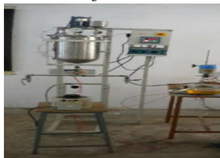
Figure:1 Experimental setup