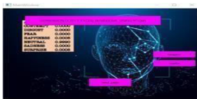
Fig no.3. I IMAGE ACQUISITION

Image acquisition can be defined as the act of retrieving an image from sources. This can be done using hardware systems such as cameras, encoders, sensors, etc. It is undoubtedly the most important step in the MV workflow, as an inaccurate image will render the entire workflow useless. Since machine vision systems do not analyse the acquired digital image of the object and not the object itself, it is paramount to obtain an image with the correct brightness and contrast. In the image acquisition step, the incoming light wave from the object is converted into an electrical signal by a combination of photosensitive sensors. These small subsystems perform the task of providing your machine vision algorithms with an accurate description of the object.