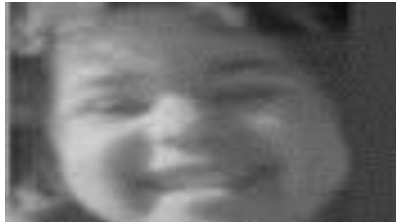
Fig no: Feature extraction (ROI)

in signals that can be more easily consumed by a machine learning or deep learning algorithm. Training machine learning or deep learning directly with raw signals often produces poor results due to high data rates and information redundancy.