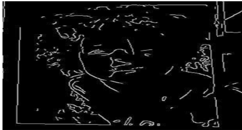
Fig no.4. Pre-processing