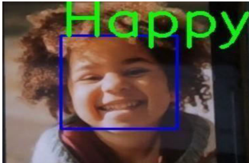
Fig no.6. CLASSIFICATION

Based on symptom duration, timing, and presumed etiology, depressive disorders are classified into 7 subtypes: major depressive disorder, persistent depressive disorder (or dysthymia), premenstrual dysphoric disorder, substance/medication-induced depressive disorder, depressive disorder due to other medical conditions, other specified depressive disorder and unspecified depressive disorder.