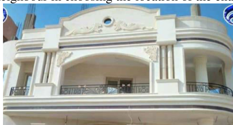
Fig. 13. The façade of one of the residential buildings, where the ratio of the dimensions and size of the fronton to the façade is unfamiliar to the eye, as well as the fact that the circular opening in the middle of it is small, the dimensions of the four circular