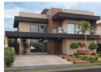
Fig. 11. Lack of local character and lack of consideration of environmental, social and cultural factors in the environment and the surrounding community.

All the causes previously mentioned are due to many factors, namely: