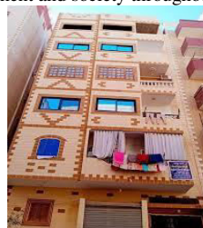
Fig. 10. Low visual and aesthetic aspects of the facade design.