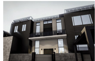
Fig. 8. The facade design of a residential building does not indicate its residential use.