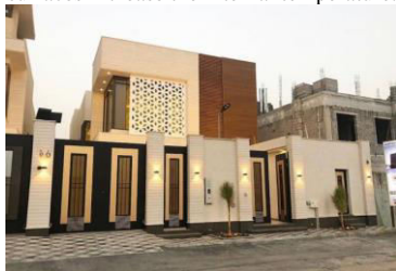
Fig. 6. Using several contradictory finishing materials and treatments in the same building.