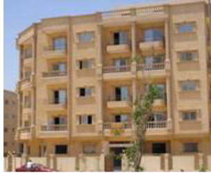
Fig. 1. Using the classical style vocabulary with a lot of randomness between the proportions, relationships, and used vocabulary combinations.

terms of simplicity, as in Fig. 2, and with a lot of randomness in the proportions and use of the vocabulary of those styles, some of the facades have overlaps of different styles.