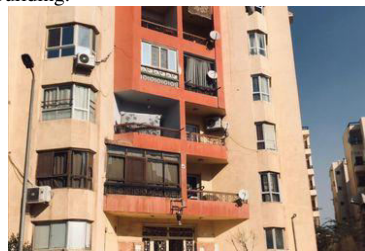
Fig. 9. Additions and alterations of residents to the facade of the building.