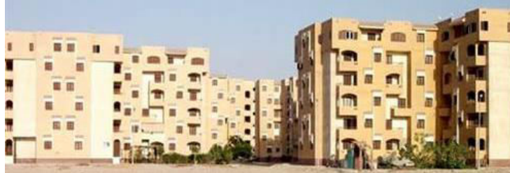
Fig. 12. Models of the housing project buildings in Damo, Fayoum Governorate, which are repeated in a stereotyped manner, led to the weakness of the mental map.

Kevin Andrew Lynch defined it as consisting of several elements or vocabulary when put together in a way that creates a mental image of the place and the factors that help or affect the mental image of the place. Among the factors that help or affect the mental image is the design of the residential building from the outside. The building may be a unit of good and acceptable design, although it does not correspond to the surrounding buildings in terms of colours, vocabulary, or style [4]. Although the process of unifying the design or making the buildings a single form weakens the visual image and the mental map that the user draws to walk between buildings, as in housing projects, as in Fig. 12 . The mint is diverse with the presence of the language of harmony, or the one spirit of design, between harmonious vocabulary and familiar architectural proportions. Thus, it can treat visual pollution.