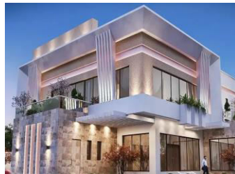
Fig. 7. Using strange and contradictory vocabulary about architecture stems from the environment and society throughout history.