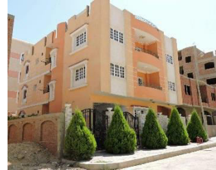
Fig. 2. Using the modern style vocabulary with a lot of randomness between the proportions, relationships, and used vocabulary combinations.