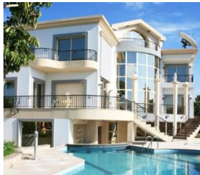
Fig. 3. Imitate Western architectural styles that are not suitable for the environmental conditions of the community where the glass surfaces increase the internal temperature.