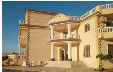
Fig. 4. Modification of vocabulary features such as columns and aperture proportions led to the deformation of the model used.