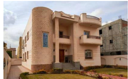
Fig. 5. The near-classical style of neighbouring residential buildings without awareness of their correctness and not achieving the style correctly.