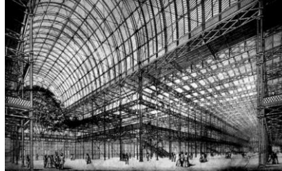
Fig. 15. The interior view of the Crystal Palace exhibition in London, using iron and glass, led to a rise in temperature, using air conditioning, and an increase in global warming http://www.greatbuildings.com .

we want with modern and available design methods and means. Parametric design has recently appeared, involving the establishment and preservation of relationships between elements while developing alternatives to design solutions such as the language of patterns [15].