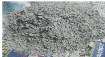
Steel Slag sample 2