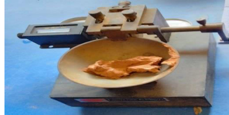
Liquid Limit Test sample 2