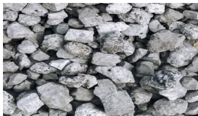
Steel Slag sample 1