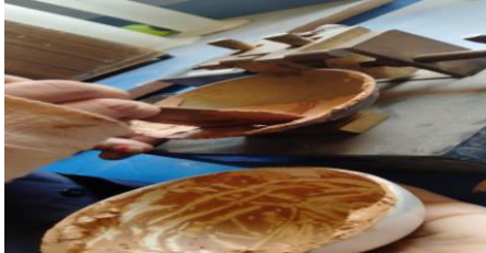
Liquid Limit Test sample 1