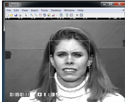
Fig input image Matlab 2014a has been used above fig shows input image of given algorithm