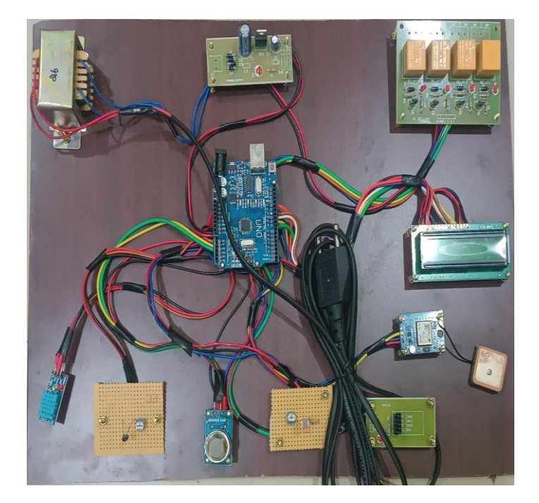
Fig.3. ATMOSPHERE CONDITION MONITORING USING REMOTE SENSING AND SOLAR CELLS BASED ON IOT

The gathered data is serially fed into a computer, which uses the com port to communicate with the Arduino device and the data recorded is stored in a text file. The text file can be directly imported to an excel file with the functionality of a macro. The imported data is then sorted and formatted, and charts are then plotted with the imported data. The charts present a visual representation of the data, which shows the weather pattern over a recorded period of time. The visual patterns indicate the weather behavior of the particular region. This is the primary objective of the present work. The DHT11 sensor provides the current temperature are humidity readings. The DHT11 gives out analog output and is connected to the analog input of the Arduino micro-controller A0. The dht11 sensor has 3 pins. Along with temperature and humidity the other values that are calculated or derived from the dht11 sensor is the dew point, heat index etc. The dew point is the temperature at which air in the atmosphere freezes to become water droplets and the heat index is the heat felt by the human skin from the environment. This is important in places with high humidity. Even though the temperature maybe lower, the body still feels warm. This is due to the high humidity in the air. Humidity is the moisture content in the air. High humidity in the air generally makes one to sweat or perspire.