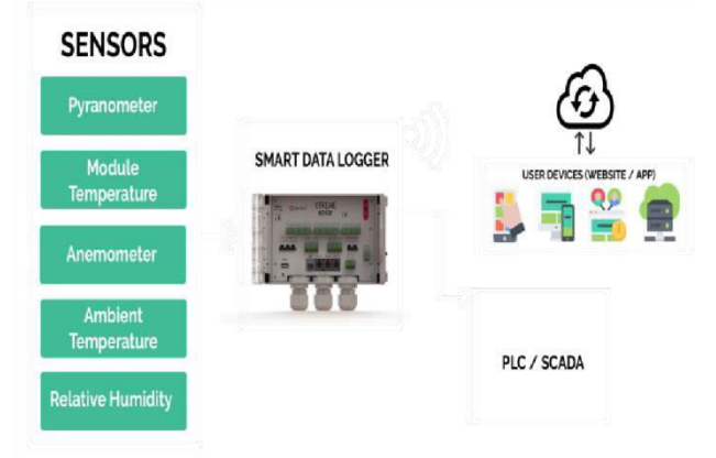
Fig 2: Weather Monitoring System

The working principle of this work describes the interdependent functionality of the components and their output. The circuit diagram is shown in Fig. 1. Firstly, all the components are initialized by supplying the required power of +5v. There are two temperature sensors, lm35 and dht11; we are using two temperature sensors to get a accurate value of temperature reading and taking the average of the two values. Depending on the temperature, hot air or cool air introduced to maintain the temperature threshold value, which is preset. If the temperature is too low for the particular area hot air is blown in to bring the temperature to moderation. Otherwise, if the temperature is too high, cold air is blown and thereby raising the temperature to the required level.