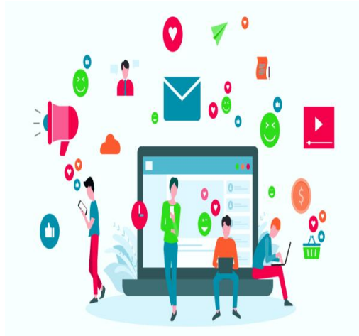
Fig 1: Social media platforms

Information popularity prediction in social networks is usually related to the information diffusion models and information-carrying patterns. The primary idea of popularity analysis is to design or learn a prediction model that can accurately reflect a hot event's information propagation law. On the other hand, the temporal evolution of event popularity can be separated into two types (stationary and nonstationary) according to its trend degree of fluctuation. This work is based on the assumption that a hot event's evolution prediction accuracy is closely correlated to its propagation type in a social network. Some of the current excellent literature on prediction and detection problems in engineering applications pays particular attention to deep learning [1–3]. It is now well established from a variety of studies (e.g., Lin, 2020 [1]) that a small dataset can train a high-precision model. Some studies of engineering problems benefit a lot by using hybrid deep learning models [2] or deep fusion models [3]. On the other hand, dynamic linear models (DLM) [4, 5] are quite suitable to be employed for the prediction problem concerning their feature extensibility. DLM has a strong interpretability compared with the deep learning models. Hence, this study seeks to obtain a general popularity prediction framework based on DLM, which will help address the evolutionary prediction problem of information propagation dynamics based on stationary theory and time-series characteristics.