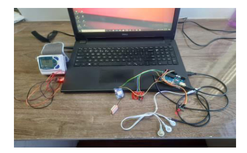
Figure 2: IOT System Connection

The implementation process was completed in a Java open-source setting. The device operates on the Java 3-tier analytics platform with a distributed INTEL 3.0 GHz i5 CPU and 4 GB RAM. We have performed experiment analysis on ensemble machine implementation to verify the outcomes.