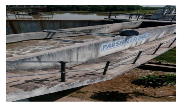
Figure.5view in Parashall Flume