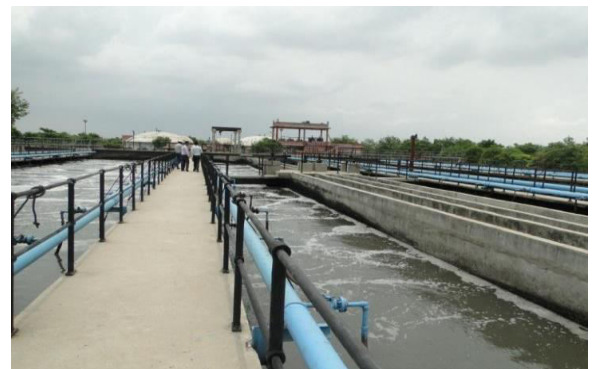
Figure.7. Aeration Tank

In primary clarifier, the sludge remove through gravity separation method. Then it transfers to secondary clarifier passing via aeration tank for activated sludge process. In aeration tank, oxygen is providing with the help of blower for survival of bacteria. A small quantity of sludge returned from secondary clarifier to aeration tank for activated sludge process. Air blowers are being operated with variable frequency drive (VFD). Man Machine Interface (MMI) is provided through. From aeration tank, the wastewater goes to secondary clarifier. This is the final treatment process for water in this plant. The water from here opens to Amanisah runnel finally.