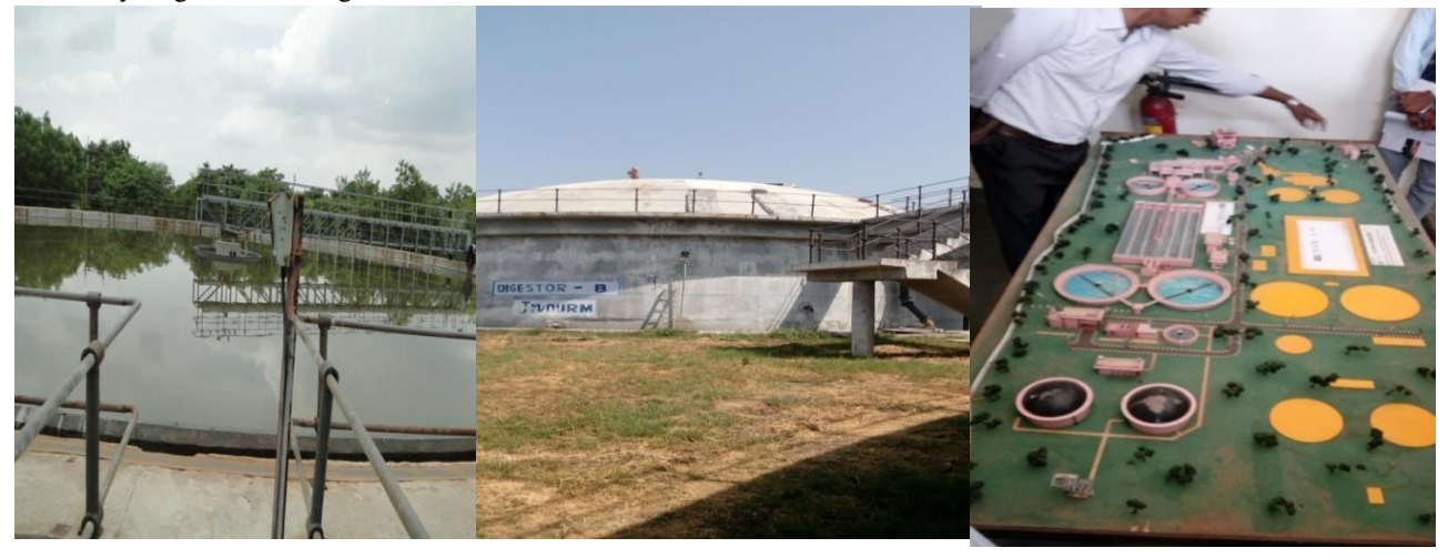
Figure.8.condary clarifierFigure.9.View of sludge digester

The sludge collected at different steps of process sent to the sump and then to the digester dome. The sludge is dewatered by using centrifugal pumps and the thickened sludge is sent to dome for anaerobic digestion. This process gives biogas and digested sludge, which use as manure by local farmers. The gas produce is using for revenue collection. The gas sent to CNG bottling plant, which gives them cost price of 6.50 RSPNm<sup>3</sup>. For smooth running of plant and follow the BIS standards for treated water, lab is setup on the STP site. The laboratory is fully furnished and all necessary equipment's for testing water is available here. In this laboratory, the water is testing at every stage for ensuring the health of the STP.