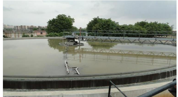
Figure.6. Primary Clarifier