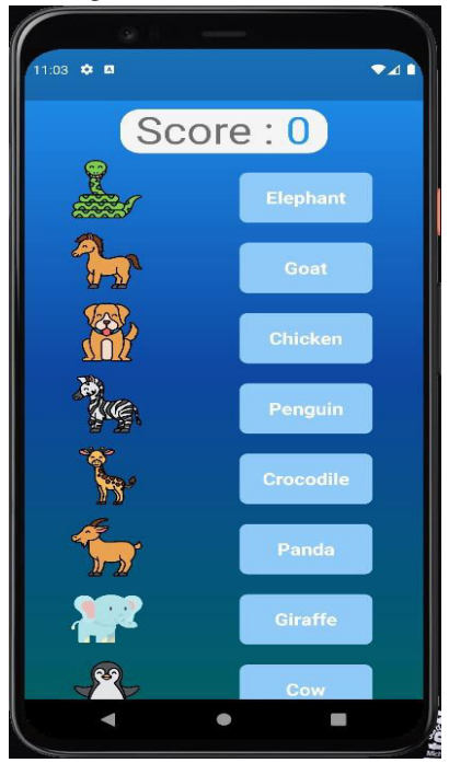
Fig (d) Drag & Drop Game