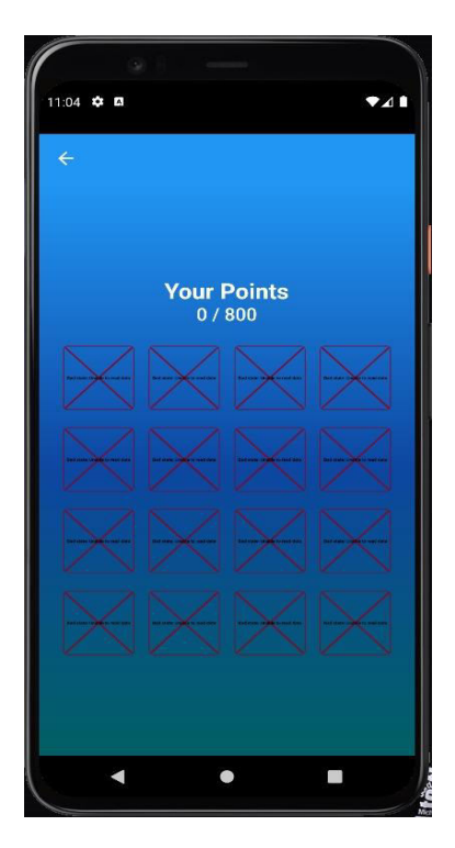
Fig (e) Memory Game (Flip the cards)