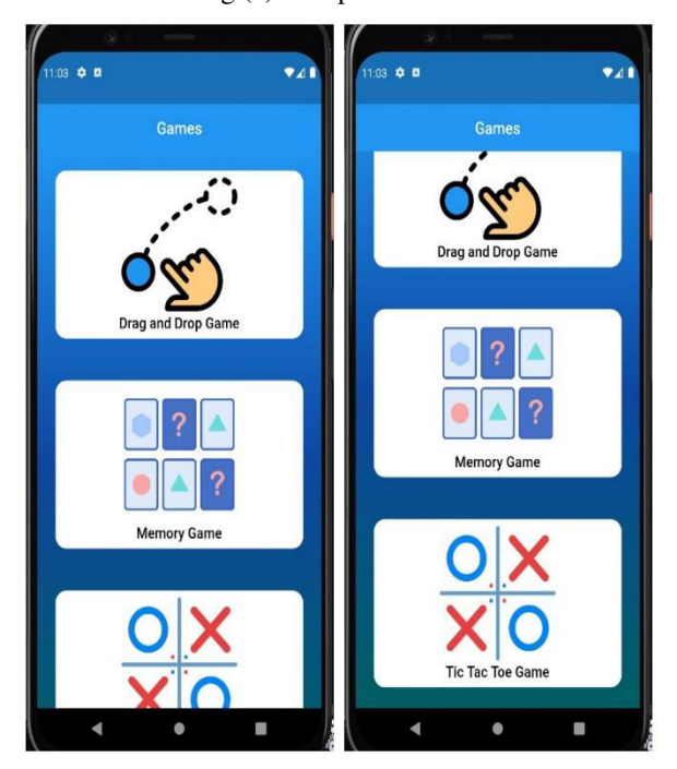
Fig (b) Homepage of the gaming application