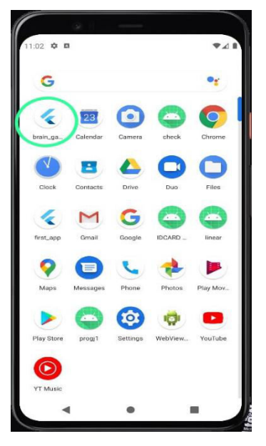
Fig (a) user phone menu

Figures show the results of gaming application for the elderly using dart and flutter. Fig (a) shows the user phone menu(b) Homepage of the gaming application(c) Tic-Tac-Toe Game (d) Drag & Drop Game(e) Memory Game (Flip the cards).