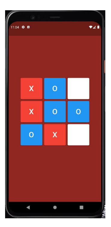
Fig (c) Tic-Tac-Toe Game