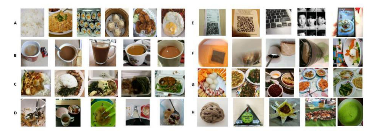
Fig:- Sample food images

• Poor Feedback Quality. It is possible that users may not have the knowledge of food item and may gave an arbitrary feedback. They may also be intending to "play" around with the technology and intentionally giving a wrong feedback. Next, we will explore some of these factors through case studies. Analysis of User Queries. We first look at some of the queries sent by users, and identify some of the key properties. We show several examples in Figure , where we have categorized them into 8 categories based on the associated challenges. While several queries are easy to classify (A), there are many challenges including inter-class similarity (B), intra-class diversity (C), incomplete food (D), non-food (E), poorly taken photos (F), multiple food items (G), and unknown foods (H). Detailed descriptions are in the caption. Query Images vs Our Dataset. Here we present a couple of case studies based on Food Albehaviour we wanted to investigate.