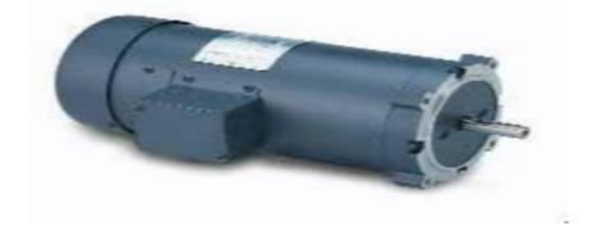
Fig. Dc Motor

DC motors are electric motors that are powered by direct current (DC), such as from a battery or DC power supply. Their commutation can be brushed or brushless. The speed of a brushed DC motor can be controlled by changing the voltage alone. By contrast, an AC motor is powered by alternating current (AC) which is defined by both a voltage and a frequency. Consequently, motors that are powered by AC require a change in frequency to change speed, involving more complex and costly speed control. This makes DC motors better suited for equipment ranging from 12VDC systems in automobiles to conveyor motors, both which require fine speed control for a range of speeds above and below the rated speeds. When selecting DC motors, industrial buyers need to identify the key performance specifications, determine design and size requirements, and consider the environmental requirements of their application. This selection guide is designed to help with this process.