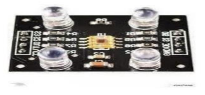
Fig. Colour Sensor TCS230

The TCS230 is a programmable color sensing module equipped with GY-31 light-to frequency converter that combines configurable 8x8 silicon photodiode array as single monolithic CMOS integrated circuit. The output is a square wave (50 percentage duty cycles) with frequency directly proportional to light intensity (irradiance). The full scale output frequency can be scaled by one of three preset values via two control input pins. Digital inputs and digital output allow direct interface to a microcontroller or other logic circuitry. Output enable (OE) places the output in the high impedance state for multiple units sharing of a microcontroller input line. The light-to-frequency converter reads an 8 x 8 array of photodiodes. Sixteen photodiodes have blue filters, 16 photodiodes have green filters, 16 photodiodes have red filters, and 16 photodiodes are clear with no filters. The four types (colors) of photodiodes are inter-digitized to minimize the effect of non-uniformity of incident irradiance. All 16 photodiodes of the same color are connected in parallel and which type of photodiode the device uses during operation is pin-selectable. Photodiodes are 120 mm x 120 mm in size and are on 144-mm center.