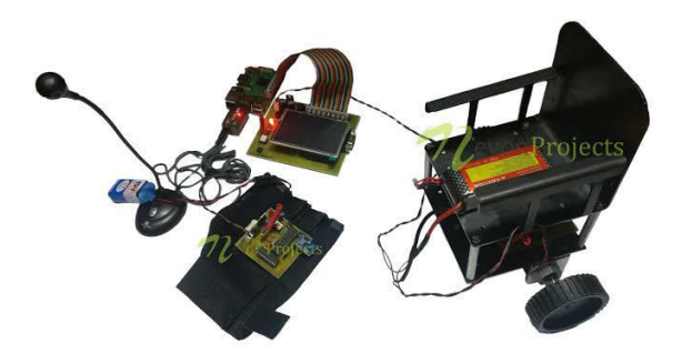
Fig 1. Multicontroller based wheelchair

Physical disability is increasing due to aging, accidents, and various diseases like paralysis. For this reason, the use of wheelchair is increasing. Some of the people who use the wheelchair cannot operate the wheelchair with their hands. So, they need the help of others to move the wheelchair from one place to the other. The android controlled wheelchair can overcome these problems mostly by the idea of implementing the wheelchair using android application, now a day's android mobile phones are commonly used. The wheelchair will be operated with the voice commands and gesture as inputs, which gives the directions as user directs. This wheelchair has gained more independent existence because the Arduino helps to covert the voice commands into outputs and the wheelchair can move freely. Along with this an ultrasonic sensor is used to detect the obstacles. By the proposed approach, the wheelchair will be working on the inputs such as voice, gesture and touch via an android phone that moves the wheelchair according to the commands provided. It. helps the physically disabled and aged people to move the wheelchair independently without any external support.