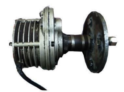
Fig 4. BLDC motor

A brushless DC motor (BLDC motor) is an electronically commuted DC motor which does not have brushes. BLDC motor is shown in Fig 4.