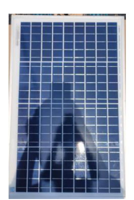
Fig 6. solar PV module

silicon, manufacturers melt many fragments of silicon together to form the wafers for the panel. Polycrystalline solar panels are also referred to as "multi-crystalline" or many-crystal silicon. Because there are many crystals in each cell, there is to less freedom for the electrons to move. As a result, polycrystalline solar panels have lower efficiency ratings than mono crystalline panels, but their advantage is a lower price point. Solar PV module is shown in figure 6. Polycrystalline solar panels tend to have slightly lower heat tolerance than mono crystalline solar panels.