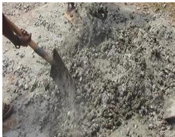
Fig.4 Crumb rubber Concrete Mixing

Mix design can be defined as the process of gathering the required ingredients in the required quantities in order to mix them in proper ratio to get the concrete having desirable strength, durability and workability. In this experimental investigation I have prepared a concrete having mix proportions of M-30 which is tabulated below: