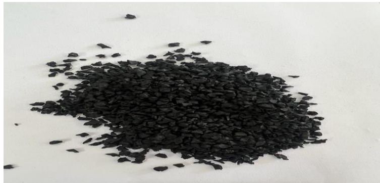
Fig.3 Waste tyre crumb