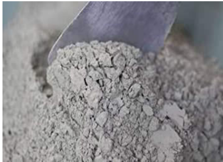
Fig.1 OPC Cement 53 Grade