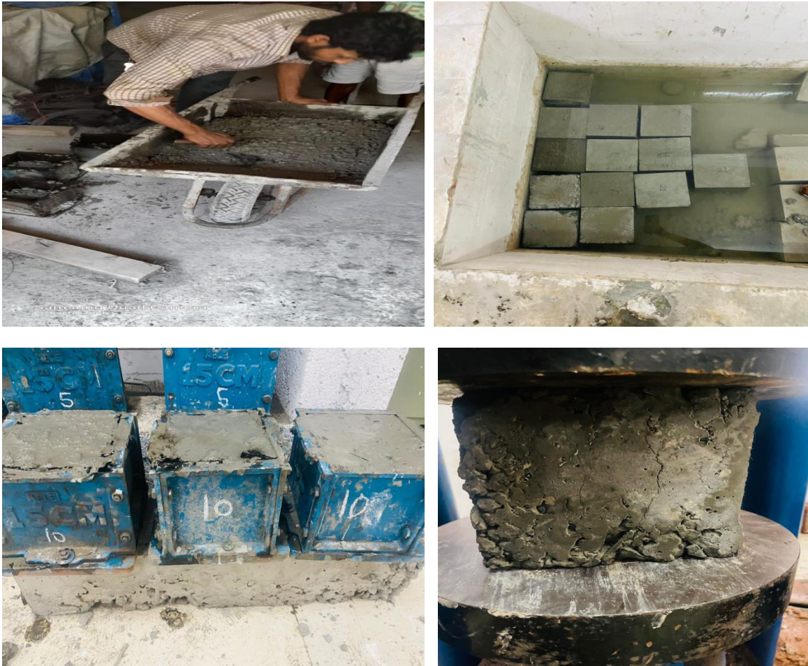
Fig.5 Compressive strength of Concrete Block