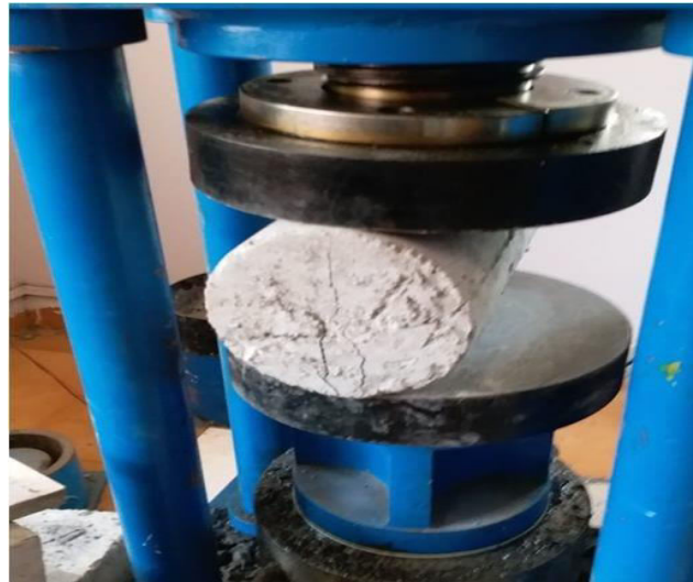
Fig.6 Split Tensile Strength

Split tensile strength is defined because the tendency of a Material to oppose an implemented forces attempting to pull it apart. The tensile energy of a material can be defined because the minimum amount of Force this is required to cut up that material. The cylinders of size 150 mm via diameter and 300mm through length that we've casted have been compacted in vibrators after which after de-moulding and curing them, the checks were performed on them after 7 and 28 days respectively to check there break up tensile strengths.