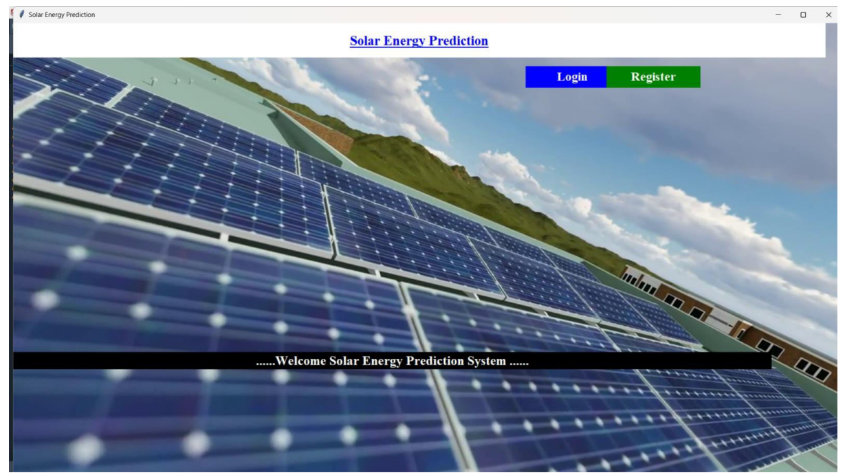
Fig-2: Home Page

The Home page encompasses various sections, including the home page, contact form, registration page, and dashboard, providing an interactive platform for users to navigate, communicate, and access different features.