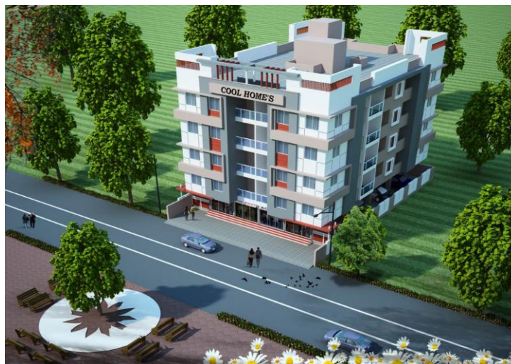
Fig 1 Cool Homes Ravet

Case study of a G+4 proposed building of 24 flats and of 4 shops in Ravet, PUNE