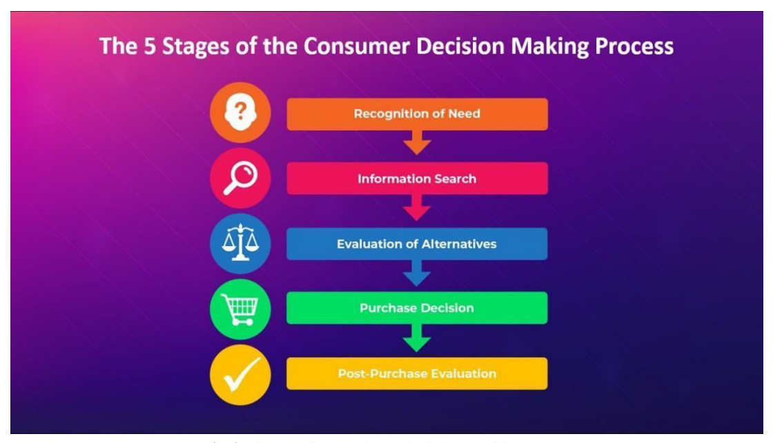
Fig.2 Phases of a purchase decision-making process

Carefully considering the stages of purchasing (Omar &Atteya, 2020) can be a problem-solving task for youth regarding their decision to buy a good or service. They go through several stages in this effort to achieve the desired result. Therefore, the buying process begins long before the actual purchase and has effects for a very long time. There are generally five basic phases to making buying decisions, although customers can skip some of them when making small purchases. Below is the buying process cycle: