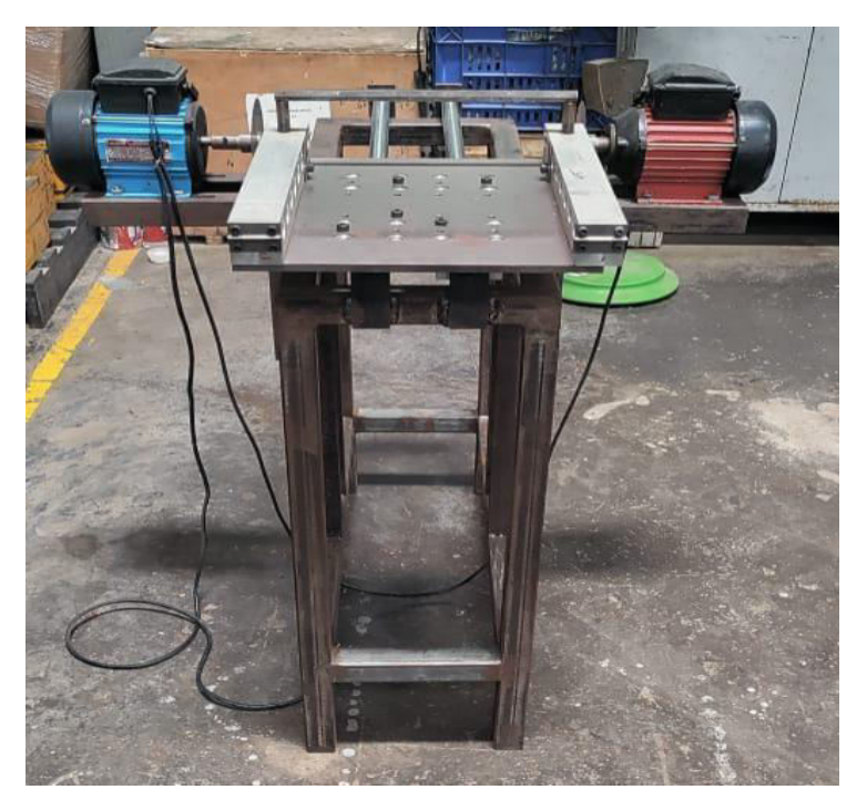
Figure 7: Ad Blue (DEF) Plastic Pipe Cutting Machine