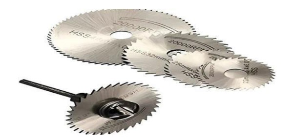
Figure 3: Cutting wheels