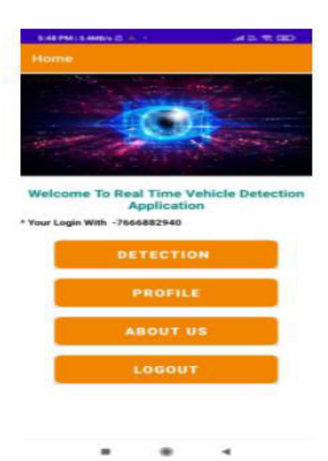
Fig. No.2 : Home page