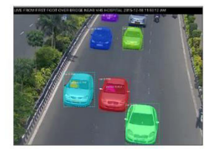
Figure 4.5 Vehicle Detection and Classification from Image