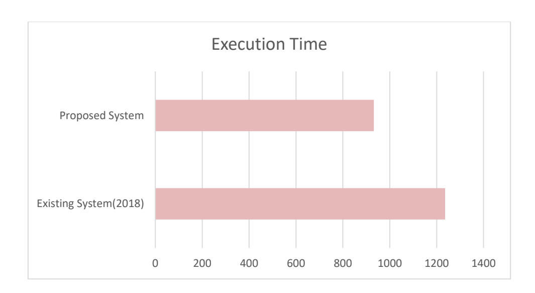
Figure 3: overall system execution graph