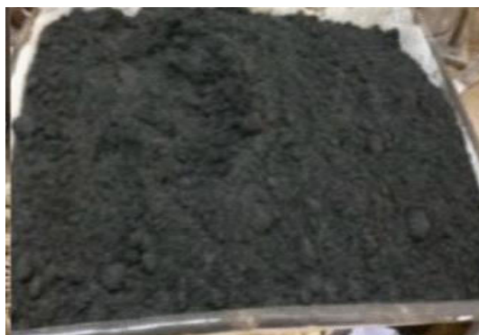
Table 2: Physical properties bagasse ash