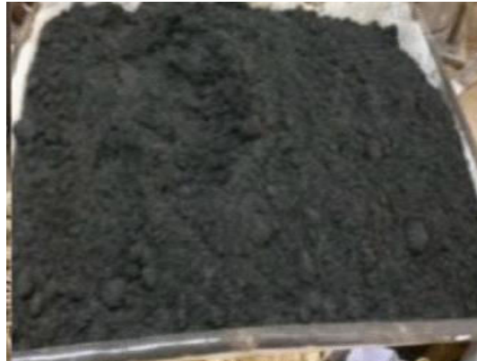
Fig No 1: Bagasse ash

Additionally, it has been found to have potential in wastewater treatment, as it can remove heavy metals and other pollutants from water.