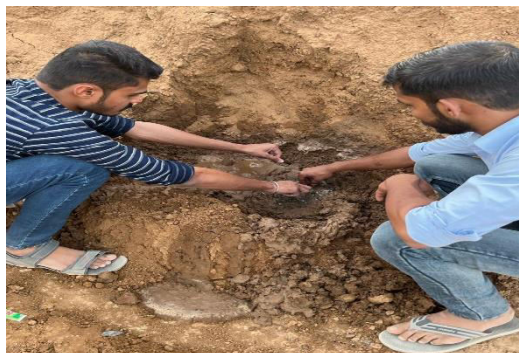
Fig No:3 Mixing of materials

The materials such as sugarcane bagasse ash, clay, sand are mixed with water based on the mix design. The mixing of the materials is a critical step in the process of making bagasse ash soil bricks. The mixing percentage should be 25% bagasse ash, 65% clay, and 10% sand. to ensure that the final product has good structural integrity.