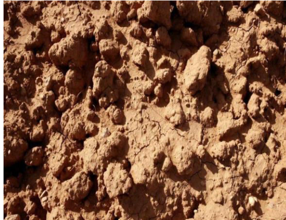
Fig No 2: Clay

Clay is a type of fine-grained soil or sediment that is composed primarily of tiny particles of minerals such as aluminium, silicon, and oxygen. These minerals are typically found in rock formations and are weathered and eroded over time by wind, water, and other natural forces, eventually forming clay. Clay is a versatile material that has been used for a variety of purposes throughout history.