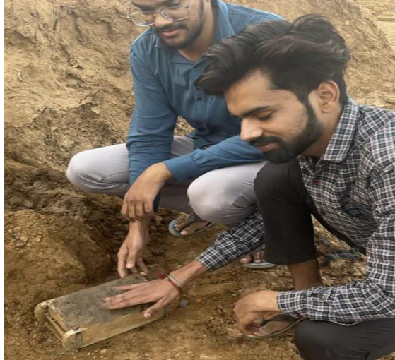
Fig No:4 Moulding of brick

It is a process of giving a required shape to the brick from the prepared brick earth. Moulding may be carried out by hand or by machines.