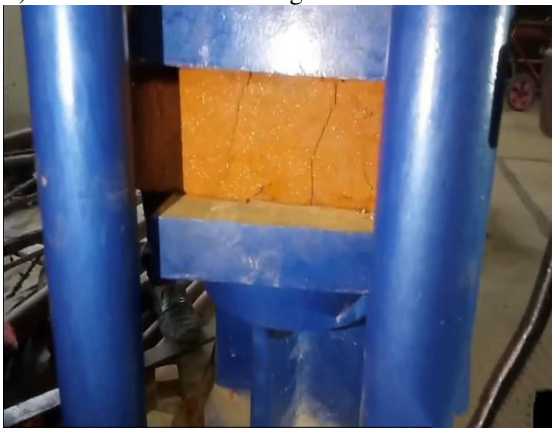
Fig. No. 10: compression testing machine