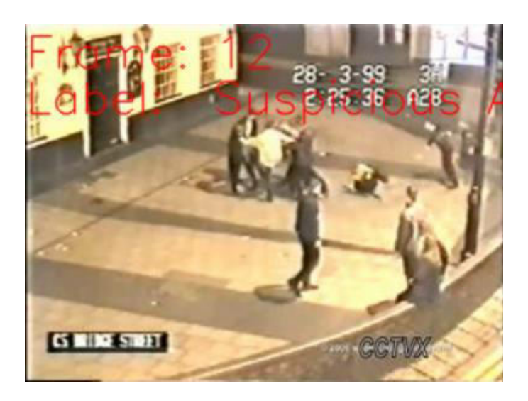
Fig 3: Suspicious Activity