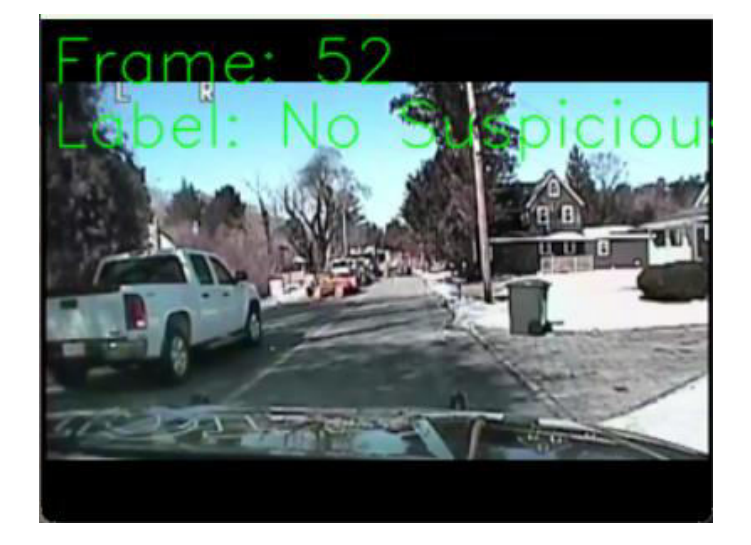
Fig2: No Suspicious Activity