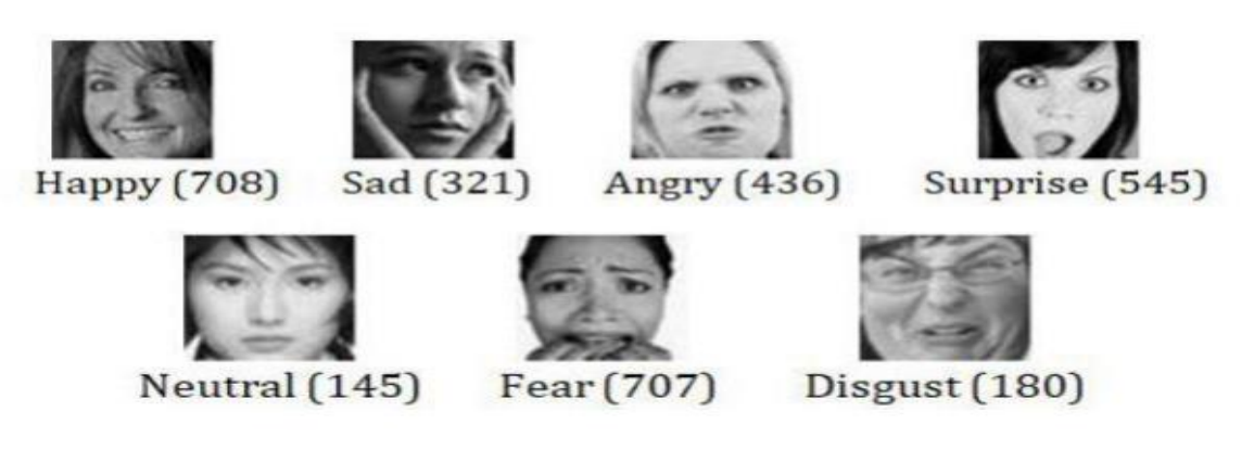
Figure 2 - Dataset Information

function in output layer for seven emotion classification. Input image size is adjusted to that 128*128*3. Furthermore, it is concatenated and passed through one more soft max layer for emotion classification and all procedure is same as above.