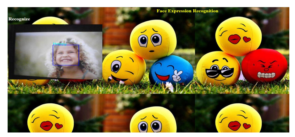
Figure 3 – Detection of emotion