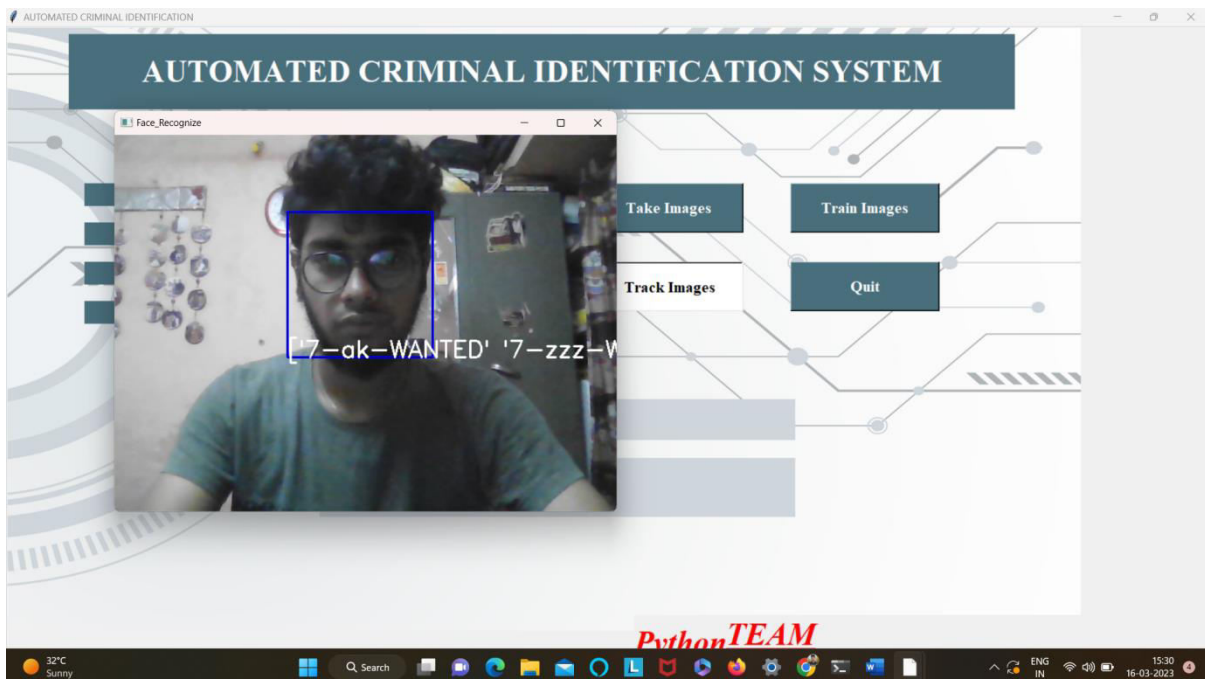
Fig 3. Image Recognition